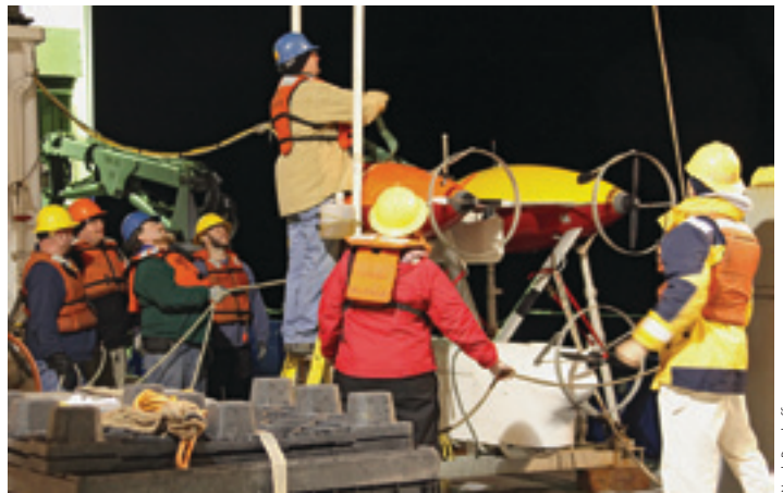
ABE is launched on the night of March 4, 2010, from the research vessel Melville off the Chilean coast for what turned out to be its final dive.

terrain, to make high-resolution maps, "sniff out" unusual chemicals emerging from the seafloor, and photograph biological communities and complex geological features.