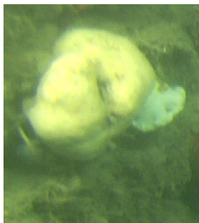
"Yellow bulbous sponge"