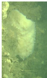
"White vase sponge"