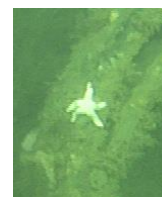
"Skinny star" Cf. Henricia sp.