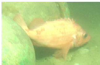
Acadian redfish Sebastes fasciatus