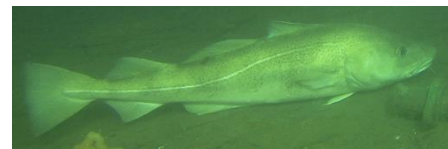
Atlantic cod Gadus morhua