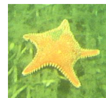
"Cushion star" Cf. Hippasteria phrygiana