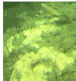
"Yellow encrusting sponge" Cf. Haliclona sp.