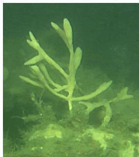
"Finger sponge" Cf. Haliclona oculata