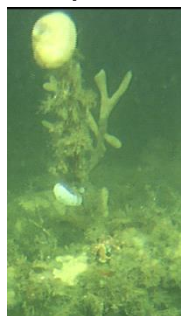
"Stalked ascidian" Cf. Boltenia ovifera